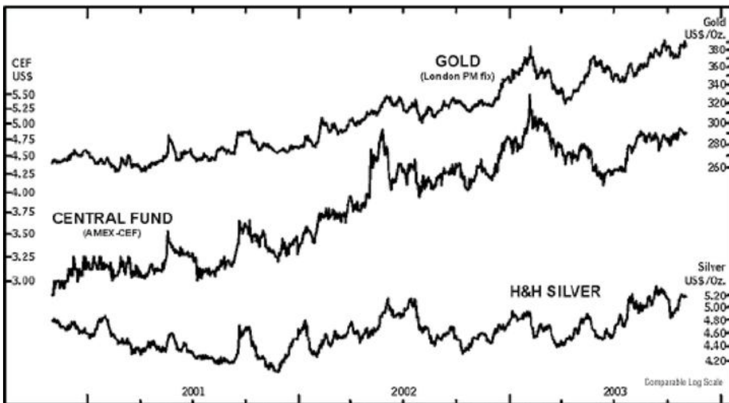
Chart courtesy of Topline Investment Graphics, P.O. Box 2340, Boulder, Colorado © 2003 10/31/03 ↑

The following chart shows the price movements of gold, silver and Central Fund's Class A shares (in U.S. dollars) over the past three years: